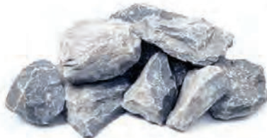
#1 & 2 Limestone