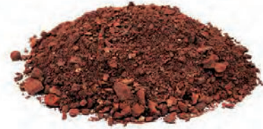
Dark Red Fine