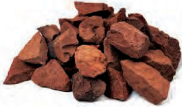
Dark Red Coarse