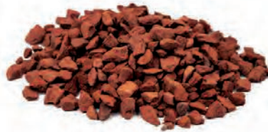
Dark Red Medium